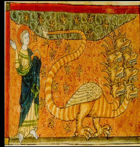
Medieval Painting (500-1400)

The first part of the Middle Ages, from about the 6th to the 11th centuries A.D., is commonly called the Dark Ages. In this time of unrest,