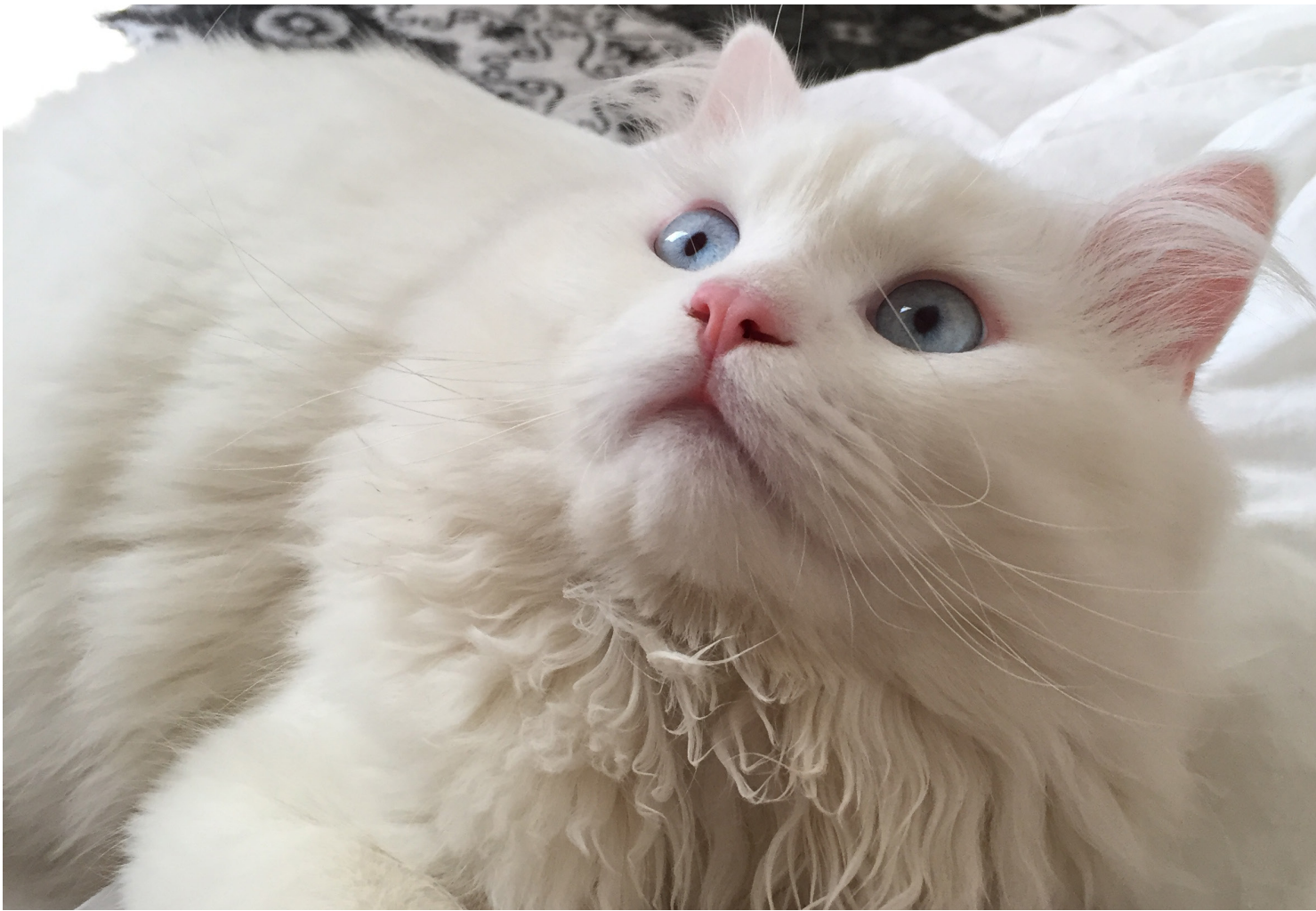
Xavier Safe At Residence Once Upon A Time Ago On Earth