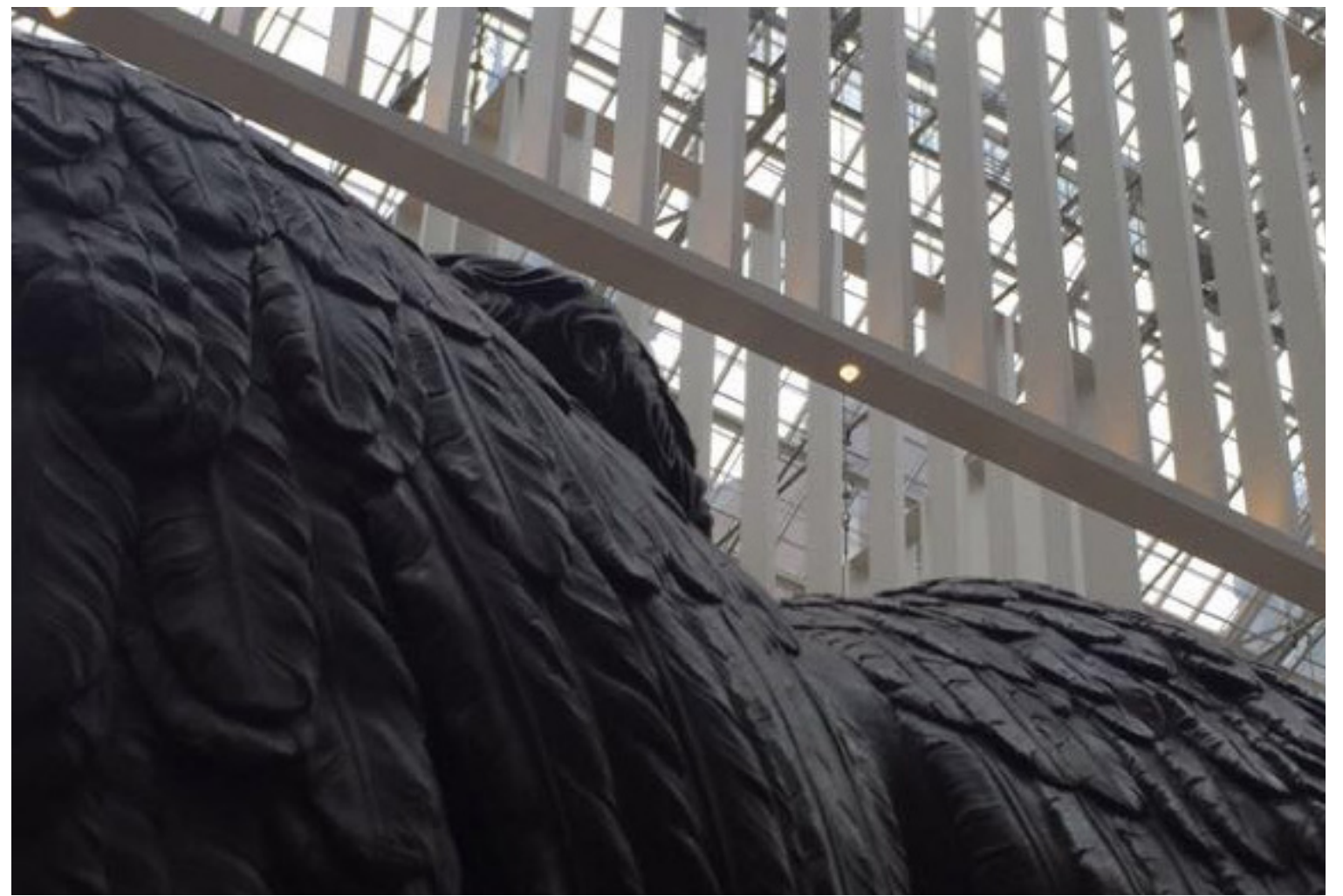
Cupid in stone.

In the bizarre trial of Cupid here in Sarooch, a verdict has been called. Cupid has been sentenced to turn into stone for two thousand years as a punishment after being indicted of being the one behind starting the padlock movement on the main bridge of planet's gateway. The movement which had been a traditional practice in earth during modern ages; is banned in majority of Vipton galaxy due to no guarantee of said relationships lasting forever. It has been said Cupid started the movement falsely to encourage other love infected individuals to start a wave in the region, much of the controversy surrounds the matter as 'love' has been