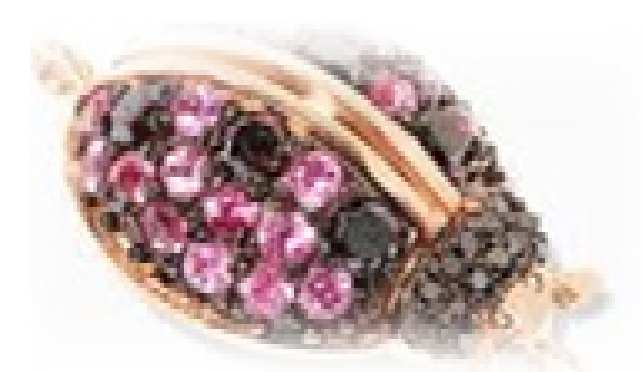
Prototypes of the wrapped insect