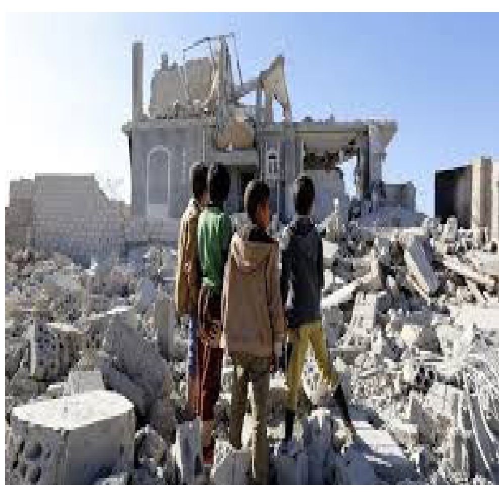
Yemeni children inspect the wreckage of their destroyed house .