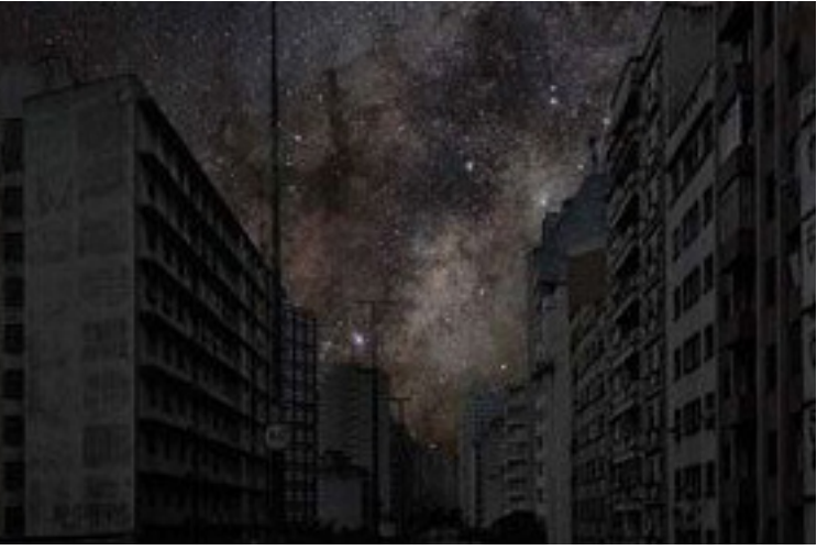
Darkness looms on earth in the absence of human beings (tumb.com).

Humans has been there since the very beginning creation of the universe. we are there for more than four thousand years ago. we considered ourselves as the most brilliant creatures ever. we are living as if the whole planet is under our control. We pretend that we care about the rest of the creatures, but in fact, we only care about ourselves. We continue to set up organizations to defend animal rights and we are the first to harm the animal kingdom and wildlife in general. We call ourselves miraculous titles. We are vanquished. Nothing can stand in the way of our progress in any field. Once we decide to do something, we will not stop trying until we reach our goal. we don't believe in boundaries, and this was behind our success at reaching the out space. We have developed a variety of techniques in different fields and have been able to blow up the whole planet if we want to. we are really great and undefeatable!. But, can you imagine what will happen if this gorgeous, supernatural creature is extinct?. The answer for this question was a study done by the University of the three geniuses in the City of Geniuses. The study pointed out that the extinction