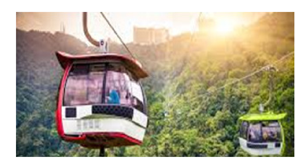
Aerial photographs of the cable. car

The cable car is one of the easiest means of transportation in the world for cheaply priced and simple to move from one place to another. It considered one of the tourist components that serve tourists. The cable car used in hard, hard-to-reach areas such as mountains, mountains and snowy areas. Many European countries use cable cars to transport tourists from one place to another. Dhofar Governorate in the fall season begins to receive millions of tourists from around the world to enjoy in the wonderful places in the states and villages