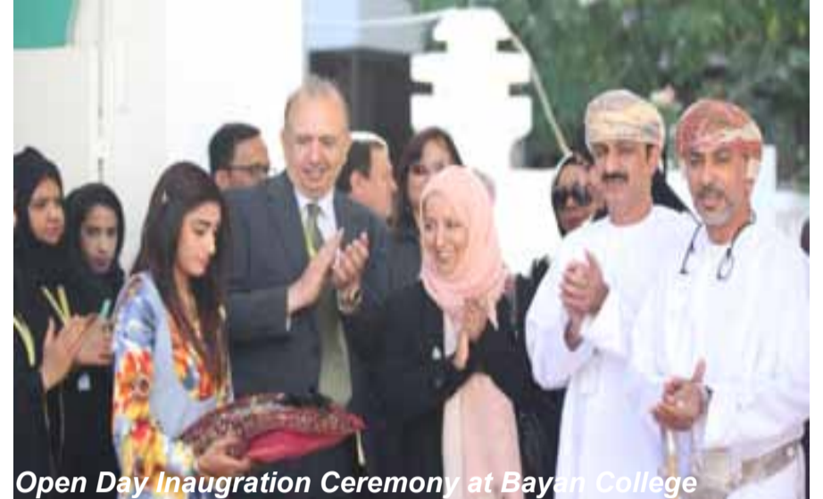
Open Day Inauguration Ceremony at Bayan College

Bayan College organised the 3rd Open Day at the College Campus on Monday – February 17, 2014.