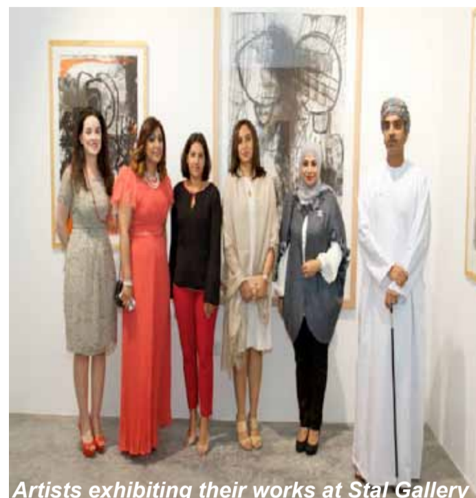
Artists exhibiting their works at Stal Gallery