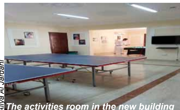
Aliva Al Jardani

Students will not be allowed to use the recreational/ activities room until further notice.