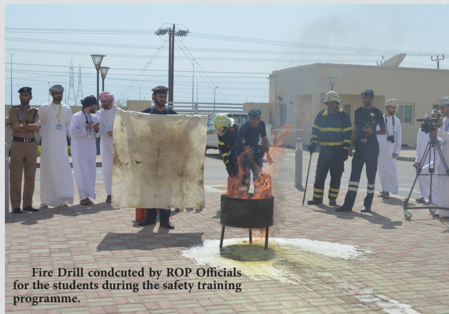
Fire Drill conducted by ROP Officials for the students during the safety training programme.